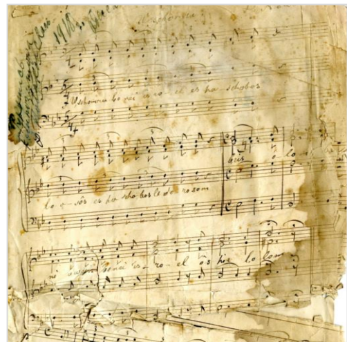
V'shomru by Dawid Nowakowsky (1918?). Papers of Cantor Froim Spektor. ©Leora Braude