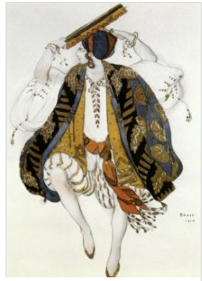
Costume sketch for a Jewish dance in Arenski's ballet "Cleopatra" (1910).